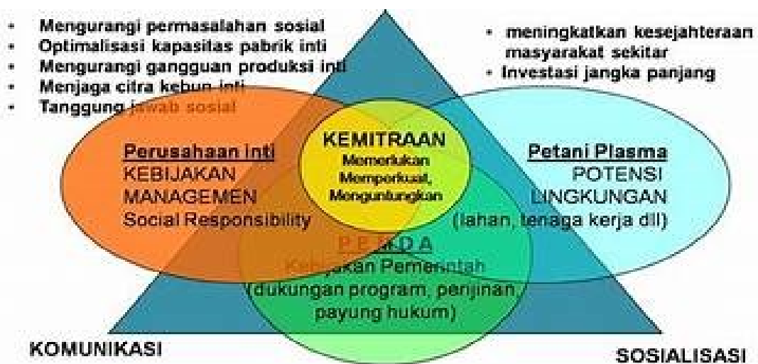
Figure 2.1 Development of partnership patterns (collaboration} in the plantation sector.

In general, plantation companies have their own processing units so that the products marketed are already in the form of processed goods. Processed products are primary production that has been processed into a form of finished goods or semi-finished goods, so that the economic value is higher. The categorization of plantations includes: (1) Core gardens are gardens built by plantation companies with complete processing facilities and owned by the plantation company and prepared to be the executors of the People's Core Plantations. (2) Plasma plantations are gardens built and developed by plantation companies (Kebun Inti), and planted with plantation plants. This plasma garden since its planting is maintained and managed by the core garden to production. After the crop starts producing, its control and management are handed over to smallholder farmers (converted). Farmers sell their plantation products to the nucleus plantation at market prices minus installments / installments of debt payments to the core plantation in the form of capital issued by the core garden to build the plasma plantation. However, the network of partnerships that need to be built between the components of plantation development can be described as follows: