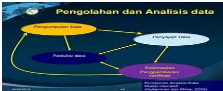
Figure 1.1 Study Model developed by Miles and Hubberman (2021)